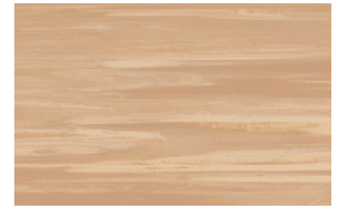
NA23 Glen Maple