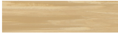
NA23 Glen Maple